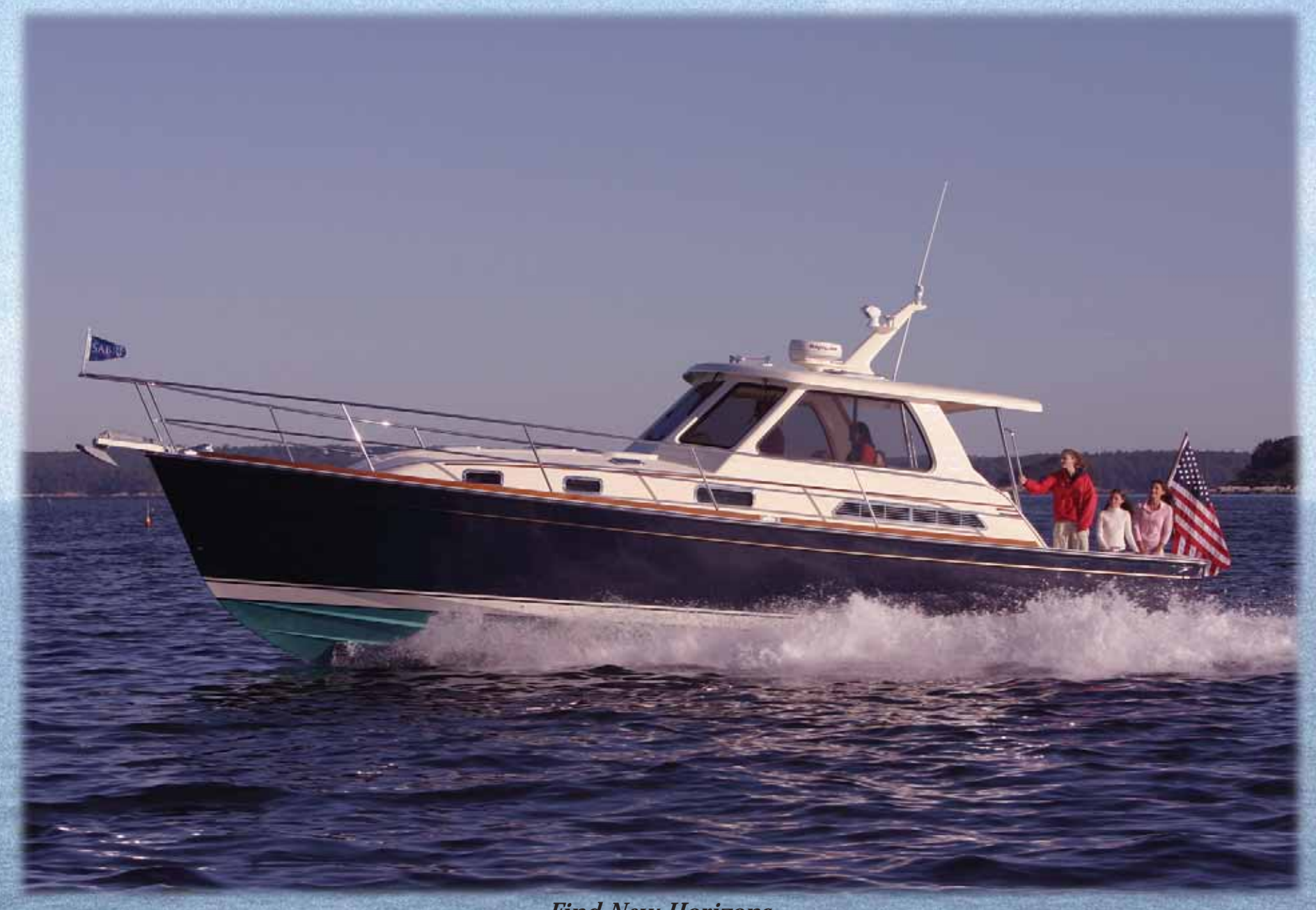
Find New Horizons